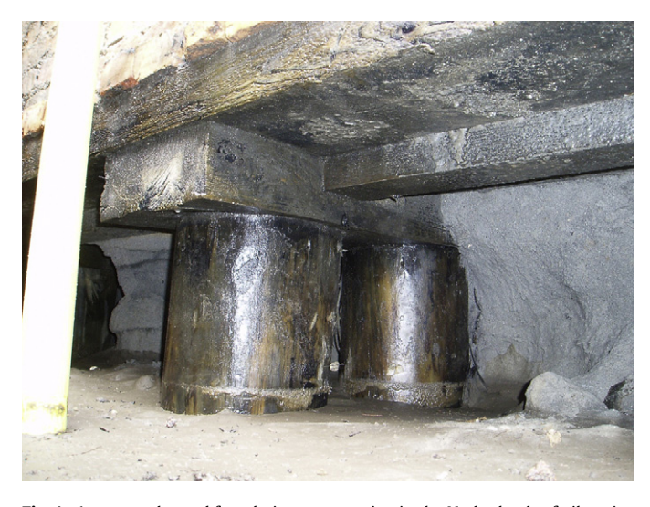
Fig. 1. A commonly used foundation construction in the Netherlands of pile pairs, the so-called Amsterdam foundation type . Photo: fugro.

cities of Hull and Bristol, under the Docklands of London and under bridges and churches in various parts of the UK. In France, wooden pilings are mentioned under numerous bridges on the Loire, Seine and Garonne rivers as well as some major historical buildings (e.g. Paris: Grand Palais, Orsay station, parts of the Louvre; Bordeaux, Nancy).