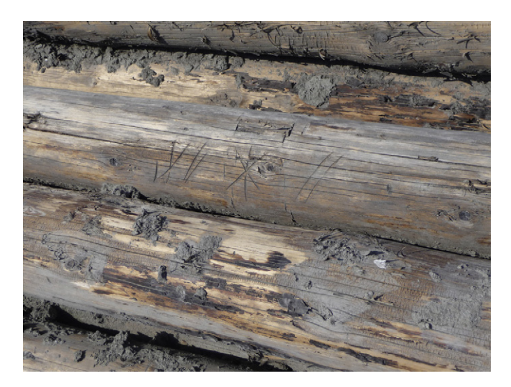
Fig. 3. Signs on pile tips of > 100 years old extracted piles.

foundations piles can therefore give additional information for historians to complete their understanding of the way of building in the past, e.g. [9].