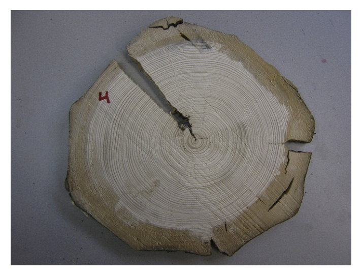
Fig. 5. Three-hundred-and-fifty-year-old spruce pile ( \varnothing 16 cm) degraded in the sapwood only by bacteria.

Until the 1980s of last century, it was believed that no decay was possible when wood was stored under water. Colonisation by bacteria of ponded wood was not to be considered as real wood decay [14]. Those bacteria cause an increased permeability by attacking the pith membrane but were thought to ignore the woody cell wall. Professor Nilsson from Uppsala, Sweden was one of the first scientists that showed that there are also bacteria that degrade the woody cell wall. They degrade wood in consortia of several species and are always present where wood is in soil contact. Their decay velocity is low but they can be active without oxygen supply