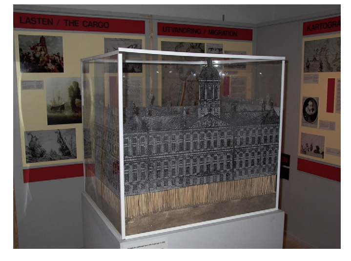
Fig. 2. Royal palace on Amsterdam Dam square. Model: Museum of Flekkefjord, photo: Niels Bonde.

facilitated by the invention of wind-powered saw mills [5]. Rafting of heavy, water-saturated oak stems only became possible by adding lighter softwood stems that kept the raft floating [6]. In addition wood for long piles was also imported from Scandinavia, Poland, Germany and Belgium. Many 17th century buildings standing on long wooden piles still exist, e.g. the Royal Palace on the Amsterdam Dam square (1640, 14,000 spruce piles 11 m long, Fig. 2), the Amsterdam Maritime museum (1656, spruce and pine piles originating from southern Sweden), and the tower of the Rotterdam St. Laurens church (1655, 500 pine piles 14 m). Until the use of motorised equipment, the transport of logs into the town and the installation of the foundation of wooden construction required many hands and was a tough job. Approximately 40 men were needed to drive the piles into the soil by pulling up a falling block of 200 to 400 kg in a strict rhythm singing (dirty) songs [7].