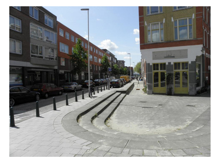
Fig. 4. Adaption of the street level to the houses with a high but homogeneous settlement because of negative skin friction, Rotterdam 2010.

specific street- and groundwater table level. For security reasons, it is accepted that the lowest ground water table is at least 50 cm above the pile head but in some areas, the height difference to the street level is less than 20 cm, which makes the water management extremely difficult. The Dutch law is not appropriate to protect house owners sufficiently against too low ground water tables and a large law suit on this topic is going on at the moment between the city of Dordrecht and the Stichting platform funderingen. Too low groundwater levels can also appear locally because of broken sewerage systems, which, being situated under the groundwater table, can act as drainage. Other causes of local low groundwater tables are evaporating trees in the spring and summer, building pits (with depths > 10 m) resulting in water extraction for several months or street work like renewing the sewage system. If temporary ground water extraction is planned, it is wise to inventory the quality of surrounding wooden foundations in order to prevent collapse because of fungal activity.